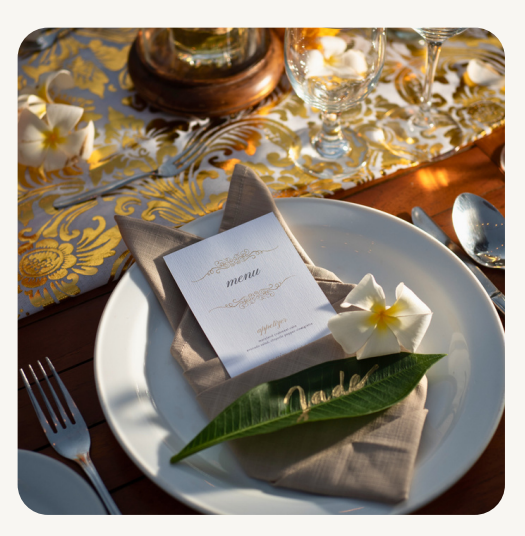
We can arrange a Balinese-style sunset dinner, set up with Tiffany chairs, marigold flowers, and elegant linens.

Celebrate with your life partner and loved ones into the evening.