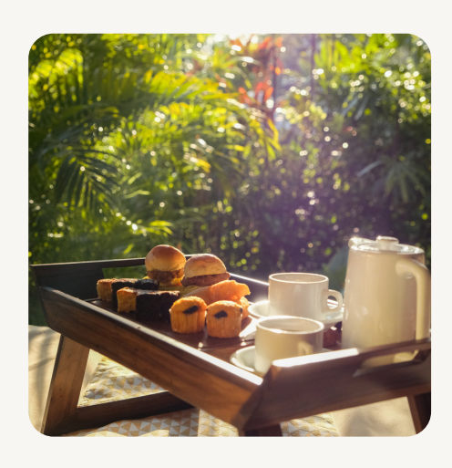
After your special ceremony, you will wake up to a delectable breakfast, waiting to be enjoyed in your private gazebo.

A stay in our most luxurious villa: Oceanview Courtyard Villa. You and your life partner will have your very own gazebo and beachfront patio overlooking the ocean. Marble floors, wood furniture, and thatched roof all give the feeling of Balinese luxury in harmony with nature.