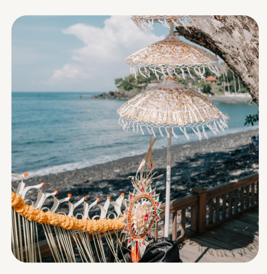
An intimate ceremony with traditional Balinese wedding decor on the volcanic black pebble beach underneath the majestic Mount Agung, with a stunning view of Tulamben Bay