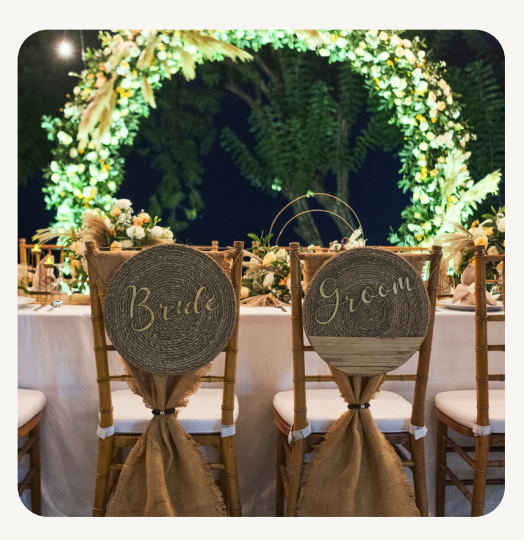
We can arrange a contemporary-style sunset dinner, set up with Tiffany chairs, fresh flowers, and elegant linens.

Celebrate with your life partner and loved ones into the evening.