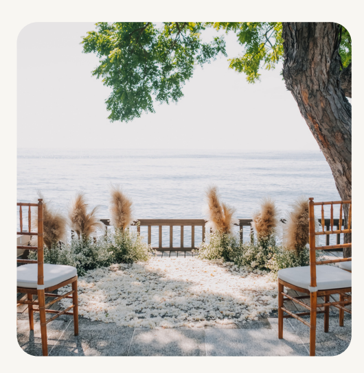
An intimate ceremony on our volcanic black pebble beach with contemporary decor that we can customize to your taste. Say 'I do' underneath the majestic Mount Agung, with a view of Tulamben Bay.